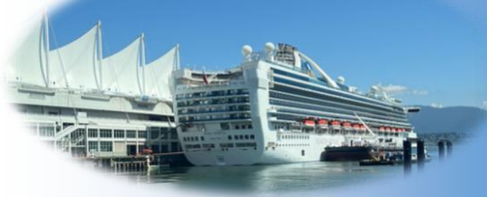
Ship waiting for Gyros to board

topics, which were later forwarded to the Board of Governors for consideration. In the afternoon, the Board reviewed the financials and approved a budget that keeps dues at $70 for now, though a By-Law update allows for flexibility up to $90 in future years. Our reserves remain healthy, with over $100,000 in the coffers.