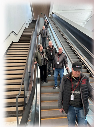
Riding a very long escalator