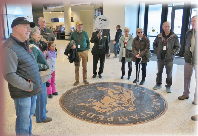
Listening to our Tour Guide