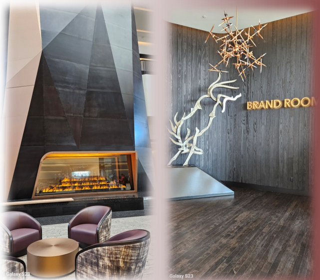
The Neon Cowboy, World's Largest indoor Fireplace in the "Exchange" and the entrance to the Brand Room, below is an example of the Public Art in the BMO Centre